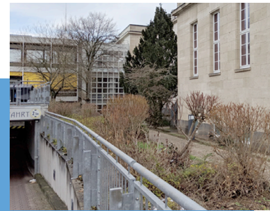
Pedestrian walkway to entrance