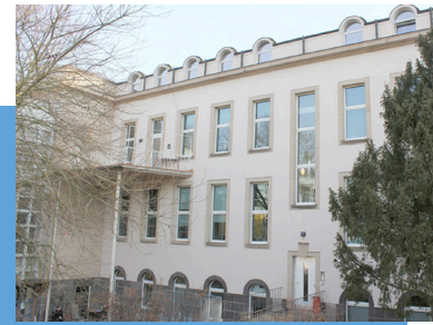
Entrance to guest rooms