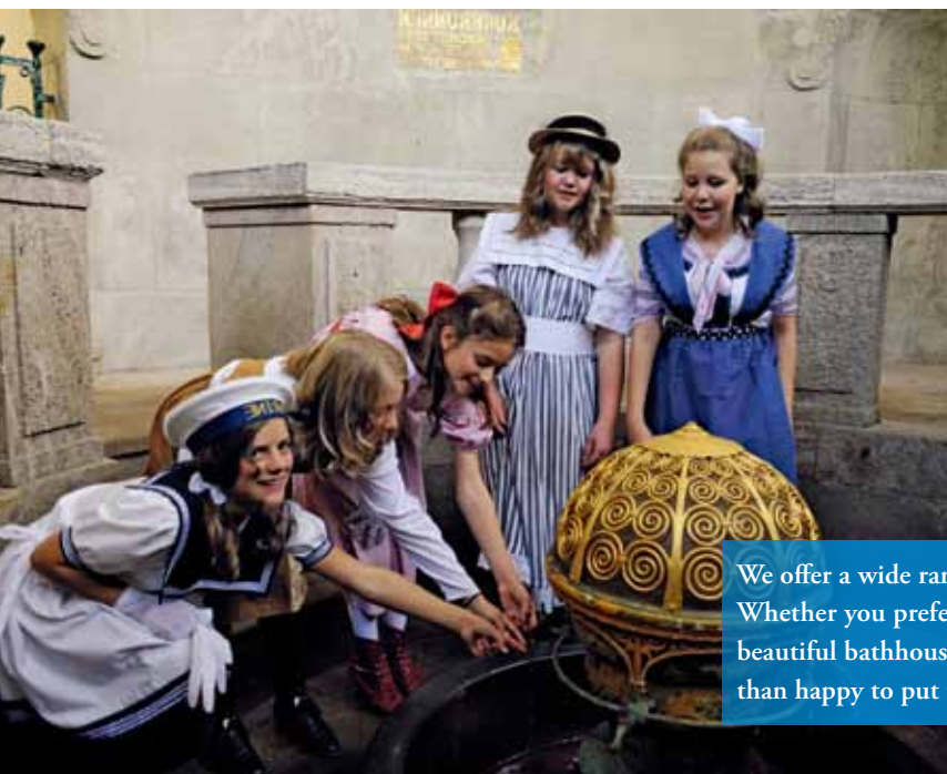
Tasting Bad Nauheim's mineral waters