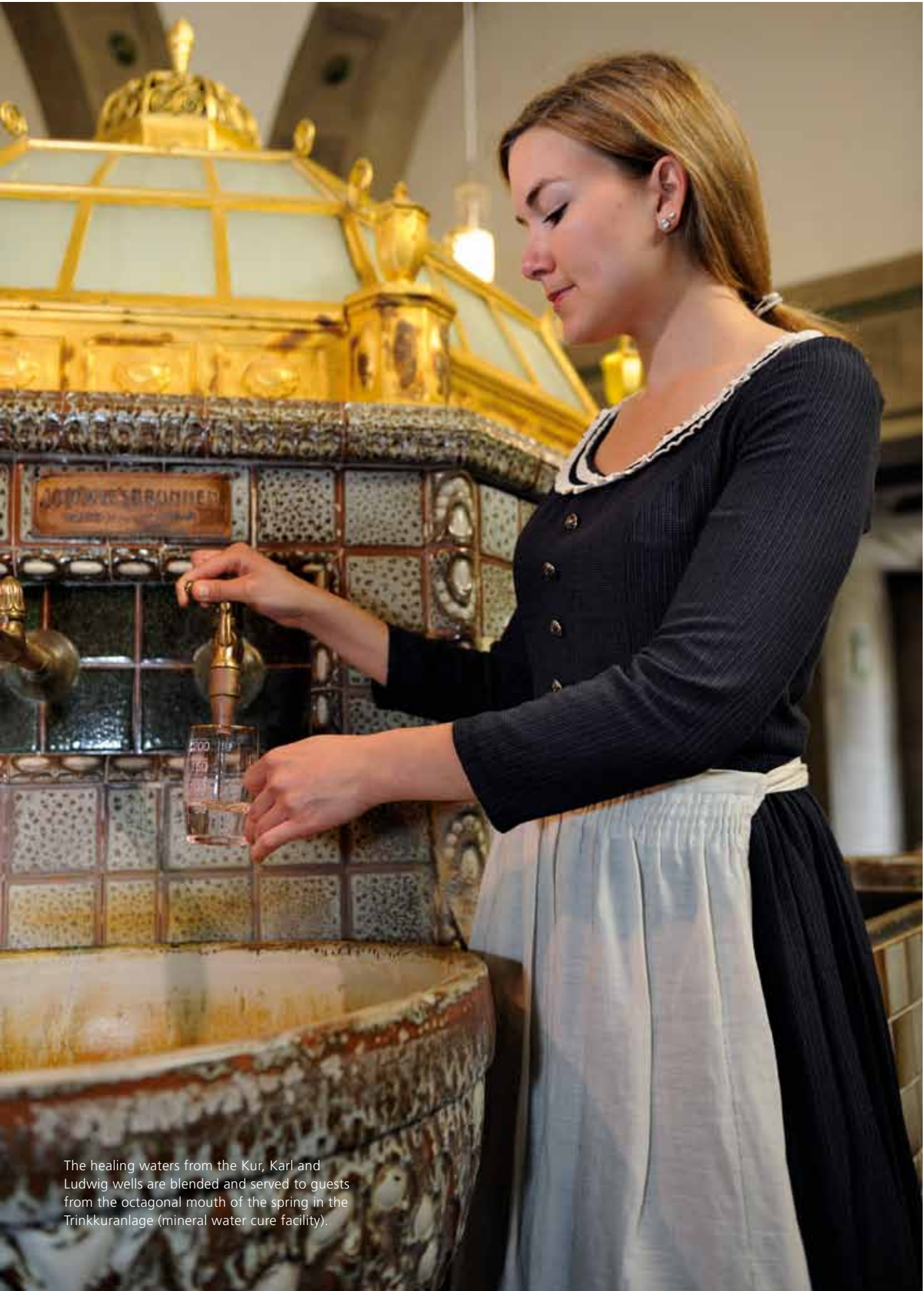
The healing waters from the Kur, Karl and Ludwig wells are blended and served to guests from the octagonal mouth of the spring in the Trinkkuranlage (mineral water cure facility).