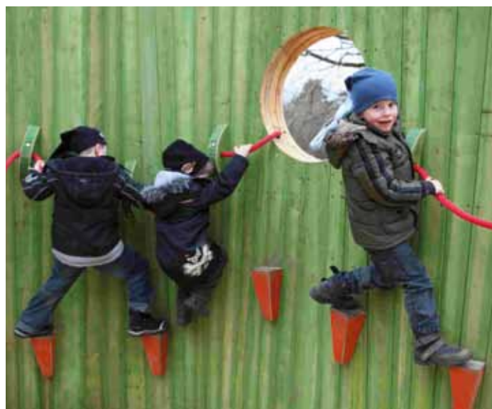
Adventure and physical activity: Climbing wall for “experts” in the Goldstein Park forest playground.

In the clearing of the Goldstein woods, happy children's laughter intermingles with concentrated play. You would be forgiven for assuming that a spa town tends to attract guests mainly in the second half of life, but Bad Nauheim's attractions appeal to a much wider audience and extend far beyond age and treatments. Even the youngest of visitors find plenty of fun activities in the town.