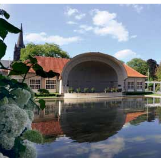
The lilting melodies of Bad Nauheim's spa music still resound today in the orchestra shell of the Trinkkuranlage (mineral water cure facility).