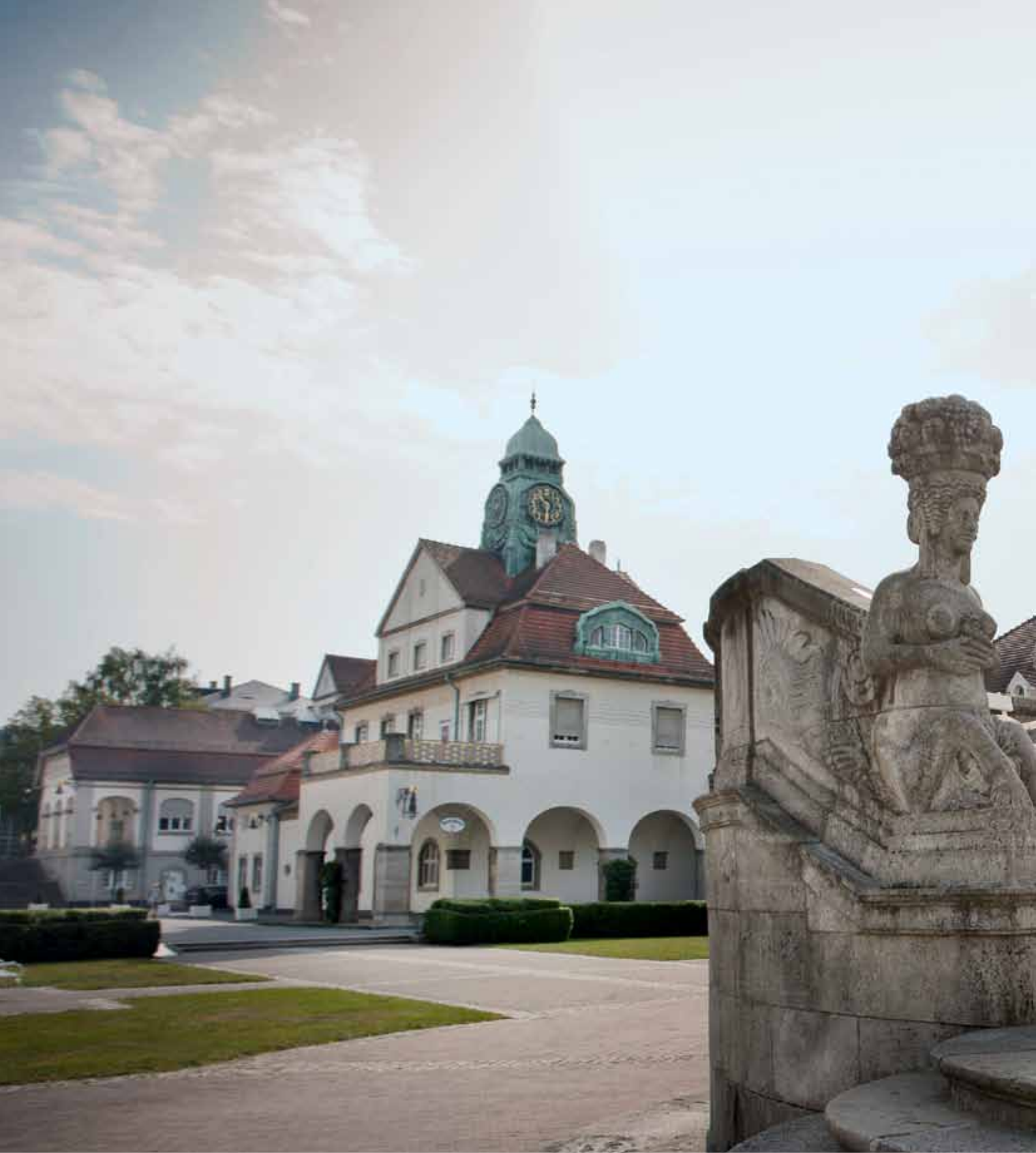
Fountain Courtyard the largest coherent art nouveau complex in Europe