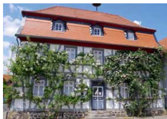
Rose growing has shaped the face of Steinfurth village since the nineteenth century. Every second year, a festival is dedicated to the Queen of flowers. Its climax is the rose parade with magnificently decorated floats.

dens is a great source of inspiration. There is a diverse programme with numerous activities and thousands of spectators cheer the magnificently decorated floats at the festival highlight rose parade on Sunday. The riotous firework display of scents, shapes and colours of roses in the streets and squares is mirrored by another one after dark: to celebrate the end of the festival on Monday night, hundreds of fireworks paint glittering blossoms against the night sky.