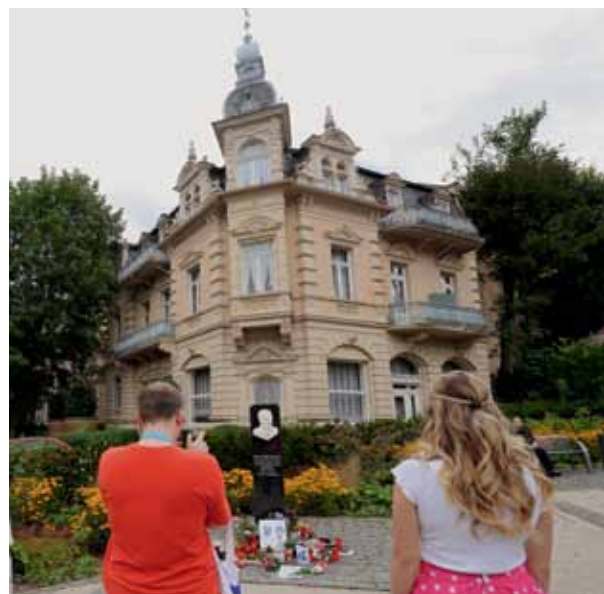
The favoured meeting place for Elvis fans from all over the world is the stele (column) in front of one of his Bad Nauheim domiciles – the former Grunewald Hotel.