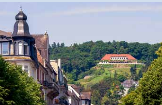
Sisi – Empress Elisabeth of Austria – already enjoyed the magnificent view from the Johannisberg of Bad Nauheim.

Your Bad Nauheim Tourist Information team.