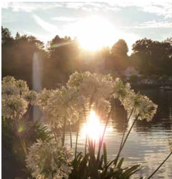
Old trees, airy open spaces, idyllic ponds and botanical rarities are characteristic of the historic Kurpark (spa gardens).