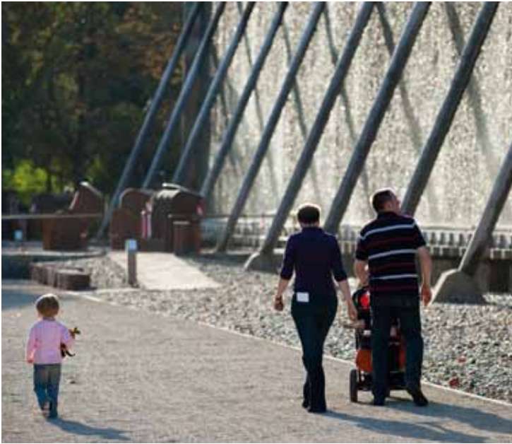
You should breathe in deeply when visiting one of the graduation houses. The salty spray has a positive effect on your respiratory organs.