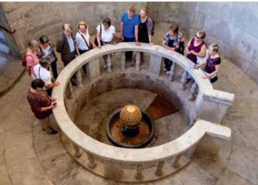
The Kurbrunnen (spa spring) contains a composition of essential minerals and trace elements that is particularly beneficial to the human organism.

The stunning Alicebrunnen (Alice Fountain) in the centre of town spouts out water from several lions' mouths into a circular, column-framed basin.