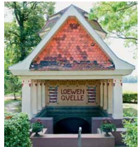
The positive effects of Bad Nauheim's mineral water won over princes, monarchs and the family of the Russian Tsar.