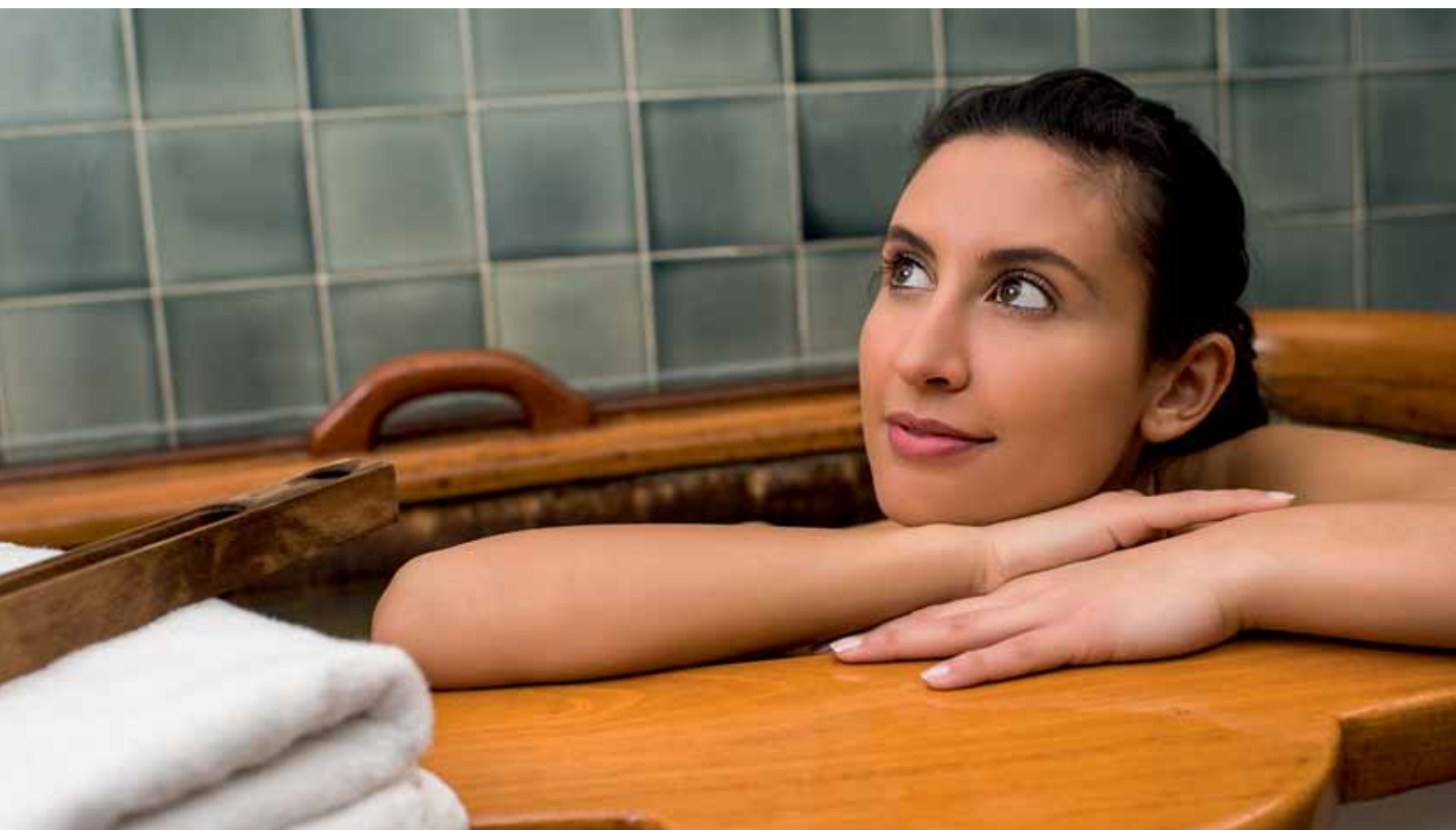
A soothing bath in one of the fine afzelia wood tubs in bathhouse 3 in the Sprudelhof (fountain courtyard) is a really exclusive experience – bathing like 100 years ago.

One place where you can immerse yourself in the wonderful bubbly warmth and soothing effects of the water is bathhouse 3, in the fountain courtyard. Experience bathing like 100 years ago, when the bath attendant invites you to a nostalgic bub-