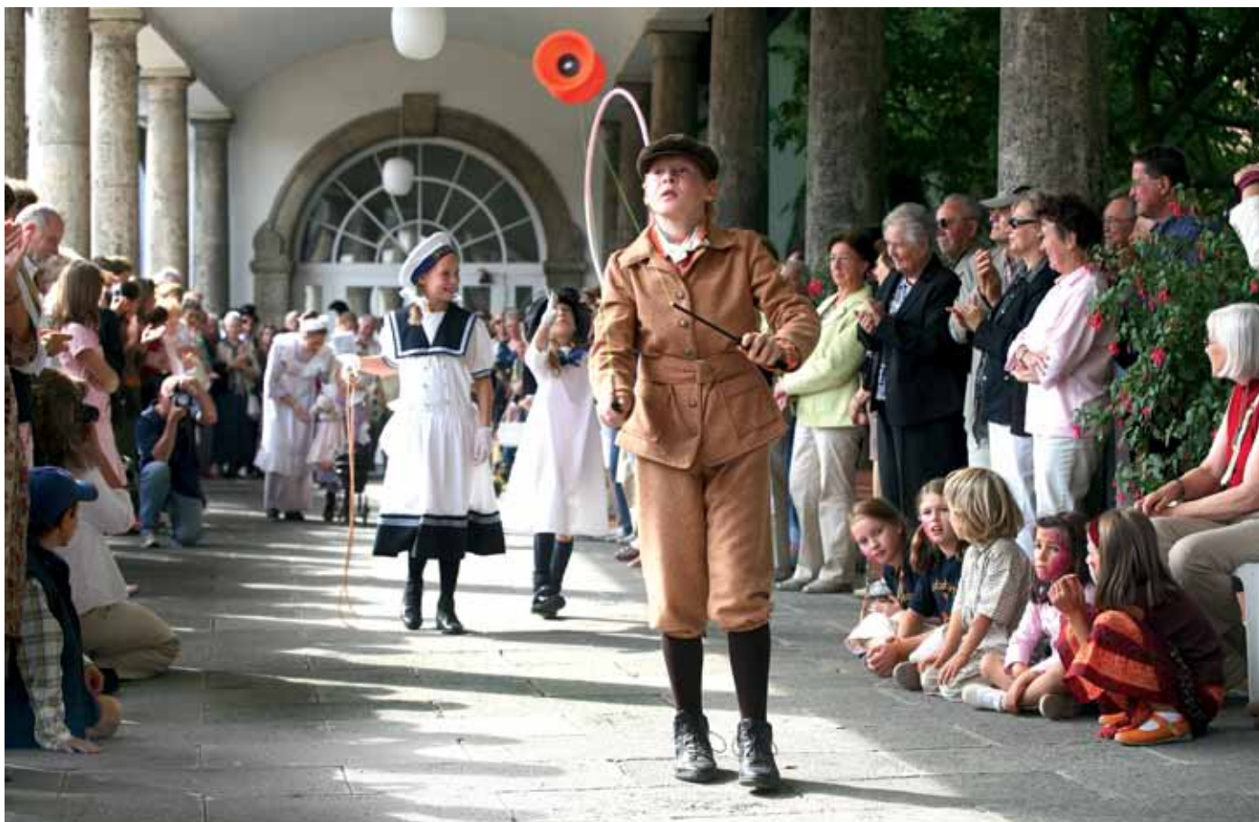
The Bad Nauheim Jugendstil (art nouveau) Festival celebrates the town's architectural richness. It offers the unique opportunity to take a journey through time to the heyday of this era.

The neighbouring pump room with its golden mouthpiece for the spring evokes memories of ancient thermal baths. The former inhalatorium, now a public library and Haus des Gastes (house of guests) dates back to 1901/02. It was built in the tradition of historicism combined with elements of the burgeoning art nouveau style in Bad Nauheim.