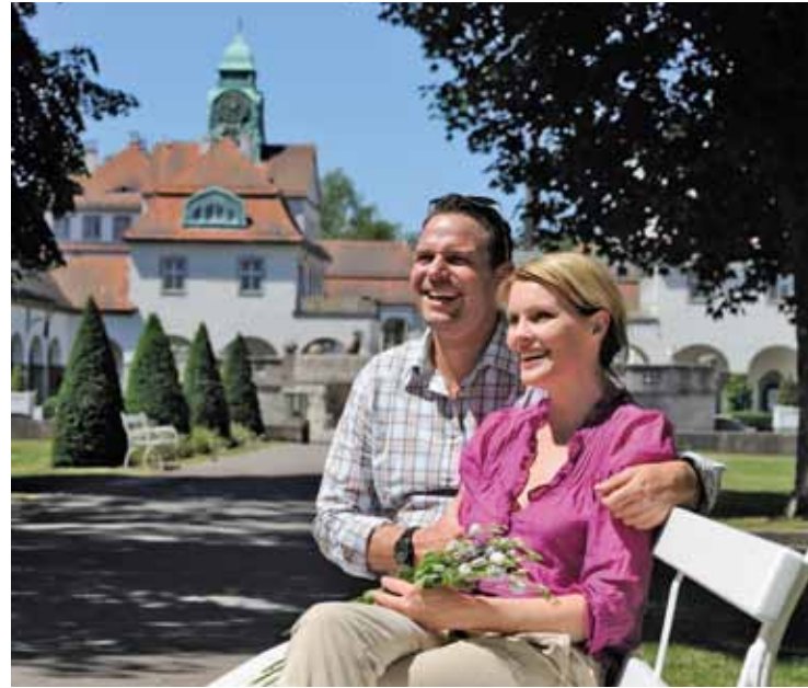
Experience the harmonious interplay of architecture and nature in the transition from the Kurpark (spa gardens) to the Sprudelhof (fountain courtyard).

Between the low ranges of the Taunus hills and the cultural landscape of the Wetterau – and a stone's throw from the financial metropolis Frankfurt am Main – numerous warm saline springs ascend from the depths of the earth. The Celts already used these springs between the 3rd and the 1st century BC to produce salt in one of the largest salt works of that era.