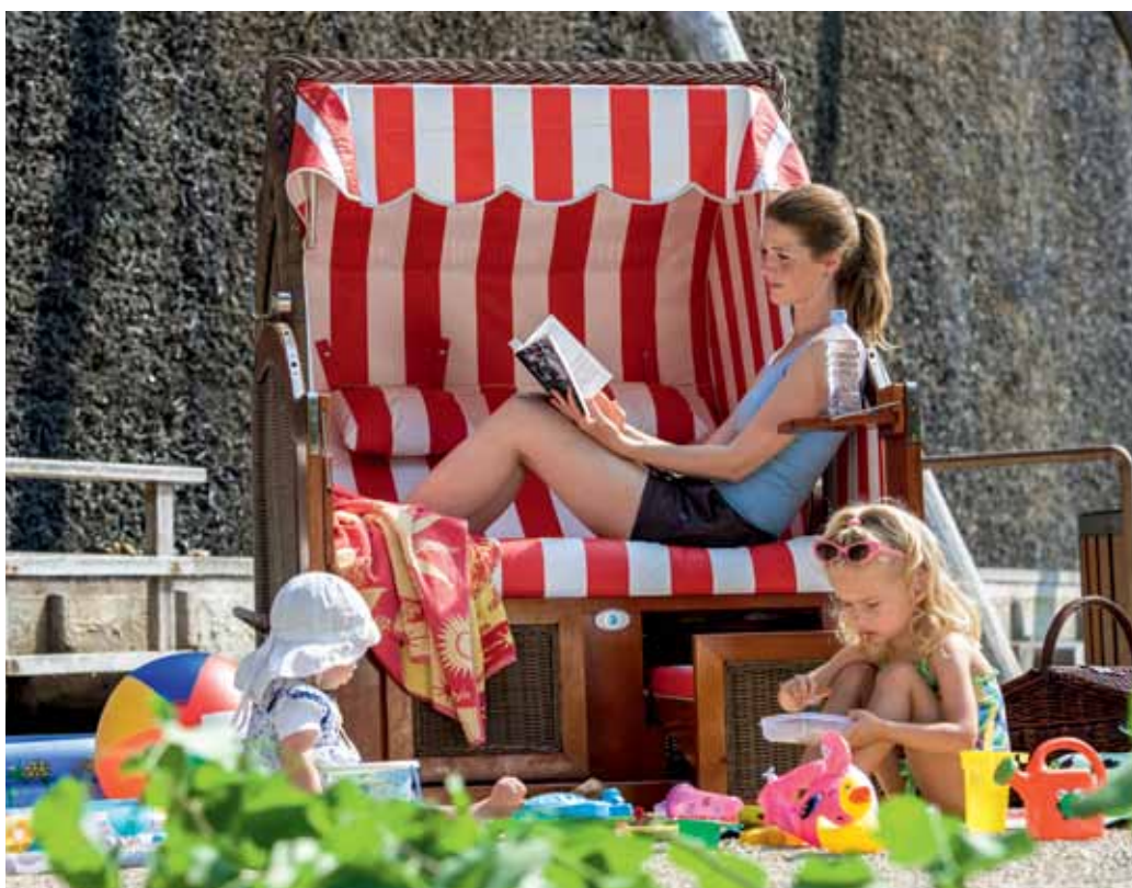
A rest in a comfortable beach chair guarantees pure relaxation.