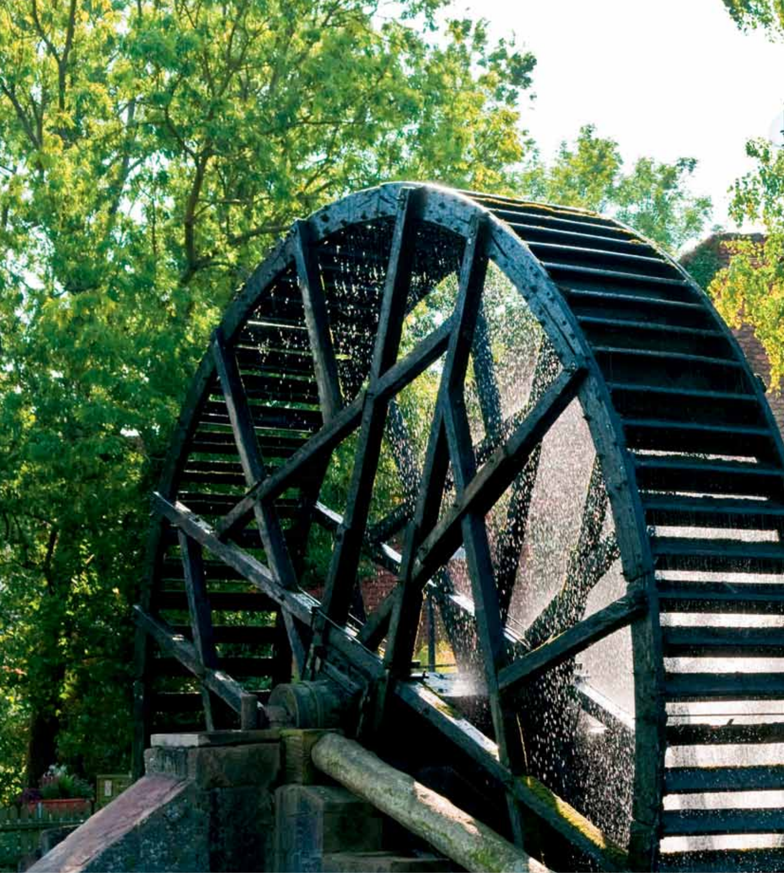
Schwalheimer Mill Wheel one of the largest water wheels in Europe